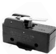
BZ, BA, BM, BE Series